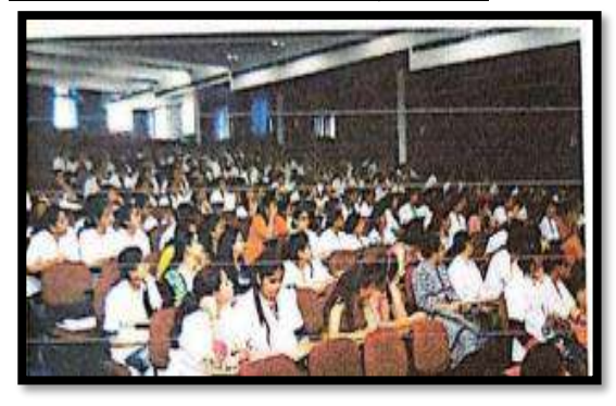
STUDENTS PARTICIPATING IN GENDER SENSITIZATION, KMSDCH, SVDU

Vice-Chancellor 10 | 2021 Sumandeep Vidyapeeth Institution Deemed to be University