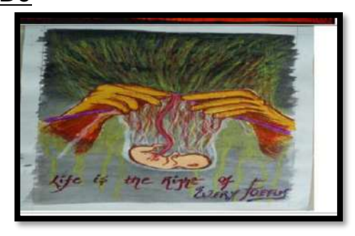
STUDENTS GROUP ACTIVITY, HUMAN VALUES PROGRAM, KMSDCH, SVDU

GROUP ACTIVITY AT PG SYNOPSIS WRITING WORKSHOP, SBKSMI&RC, SVDU